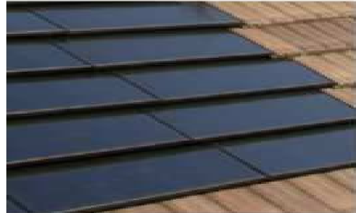
New Production Homes